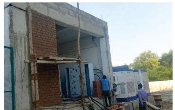
Transformer and generators installed