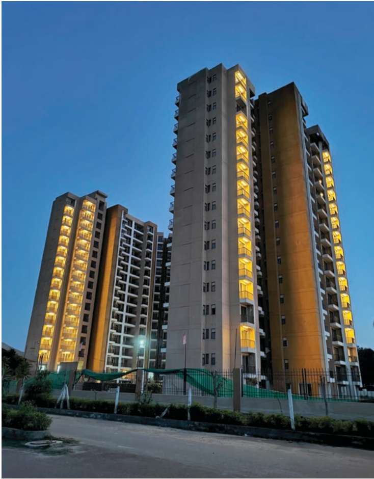
Night View of the site