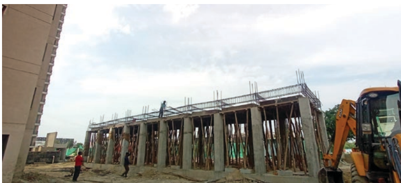
Shops in progress