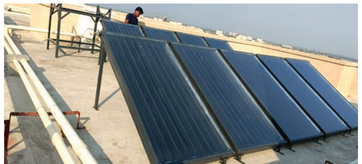
Solar panels for kitchen hot water